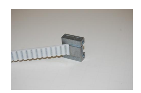
Pull the belt to tighten the wedge and the belt within the tension block.

MACRON DYNAMICS, INC. 100 Phyllis Drive Croydon, PA 19021