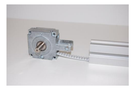
Insert the belt into the slot closest to the bottom.