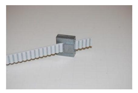
Slide the belt through both of the tension blocks so that the "M" is facing up.