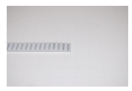
It needs to be cut down the middle so that it has enough to catch the wedge.