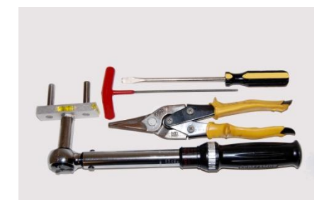
The tools you will need include a torque wrench (lb. in.), tensioning tool, tin snips, M3 allen wrench, and a flathead screwdriver.