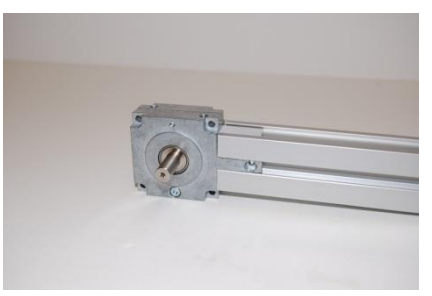
Push the belt in till it comes out the top. A screwdriver might be helpful to help along the pulley