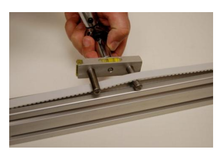
Move the cart to the end of the actuator. Then place the tensioning tool at the middle of the belt.