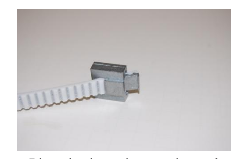
Place both wedges at the end of the belt so that the half-tooth is flush with the end of the wedge.

MACRON DYNAMICS, INC. 100 Phyllis Drive Croydon, PA 19021