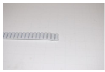
Using a sharp pair of tin snips, cut belt to length. Last tooth needs to be cut in half.