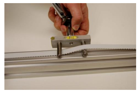
Set the wrench to the correct torque setting, adjust belt to achieve level position at the recommended torque.