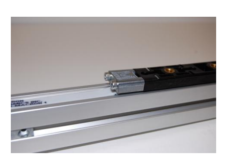
Attach the tension block to the cart using the shorter set of bolts on the drive side. The longer bolts will be used for the variable side.

P: 215-443-8888 F: 215-443-0981 macron@macrondynamics.com R e v 0 1